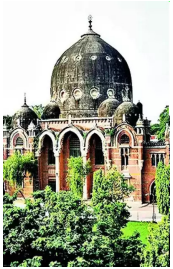
Vadodara: Members of a student outfit entered into heated arguments with of MS University's vigilance

staff on Friday when the student leaders pasted posters of 'Dean missing' at the main building of the Faculty of Commerce. The student leaders of the National Students Union of India (NSUI) were demanding that the faculty should declare a date on which students seeking admission in first year Bachelor of Commerce (BCom) can come for document verification.